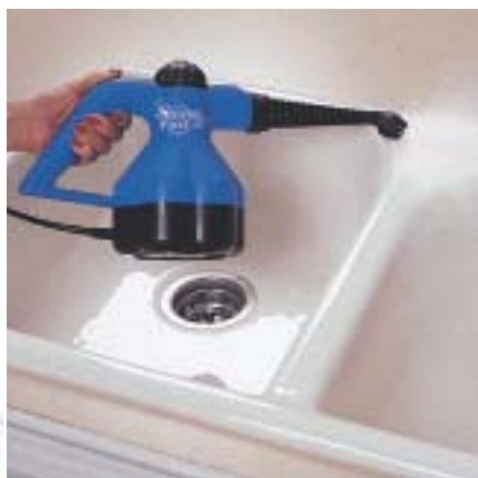
Steams Ceramic and Porcelain Surfaces