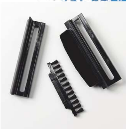
Includes Squeegee, Fabric Brush, and Lint Brush