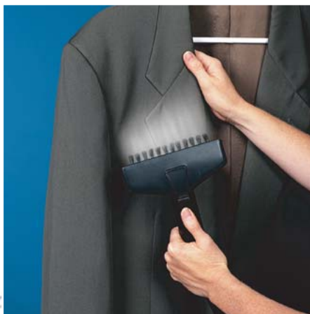
Steam Suits with Ease