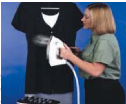
Use Vertical as a Fabric Steamer