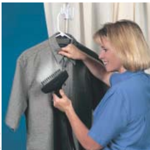
Removable Fabric Brush