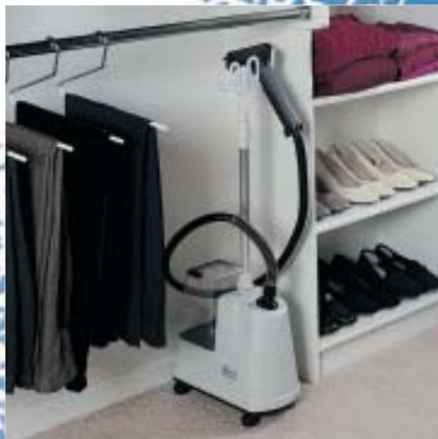
Telescoping Pole Facilitates Easy Storage